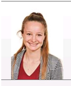
Assistant Head of Year 7