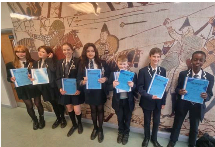
Entrants to the Think Essay competition with their certificates