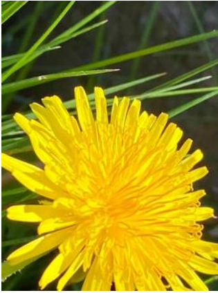
Caleb Gowland-Webb, Year 9

We had some great entries for our photography competition with the theme of "colour". We were very impressed by these beautiful results.