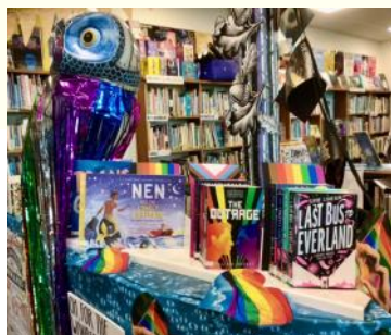
Displays in the library as part of the Pride Month.