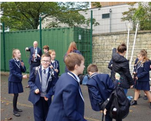
The Heads of House

The OSA needs help from the houses to create some luxury hampers to raffle at the OSA fair on Saturday 7 th December. We're asking students to bring in items in their house colour. Items can be food, drink or gifts. We look forward to seeing you there to be in with a chance of winning.