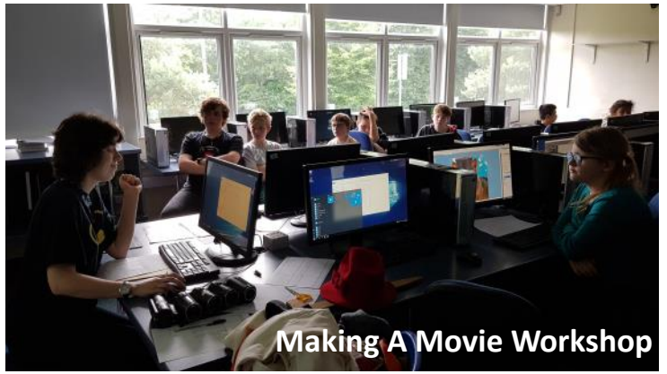
Making A Movie Workshop