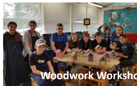
Woodwork Workshop Making Bee Houses