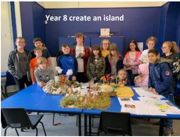
Year 8 create an island