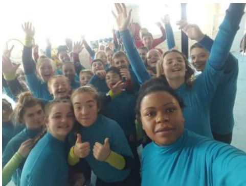
Year 8/9 Bude Trip