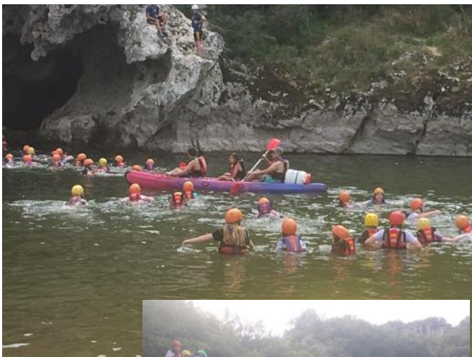
Year 8/9 PGL Ardeche/Mimosa Trip