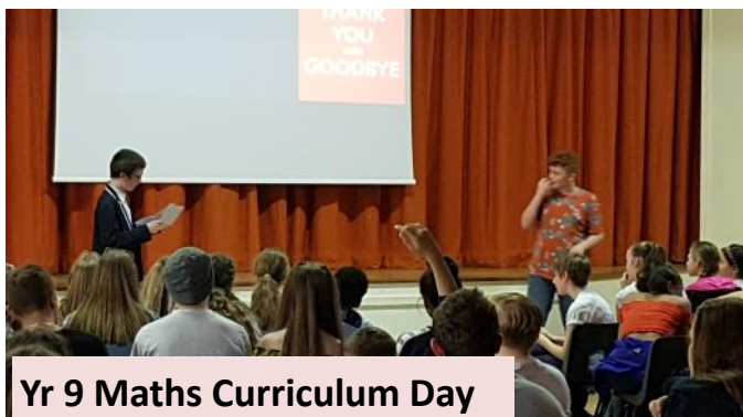
Yr 9 Maths Curriculum Day