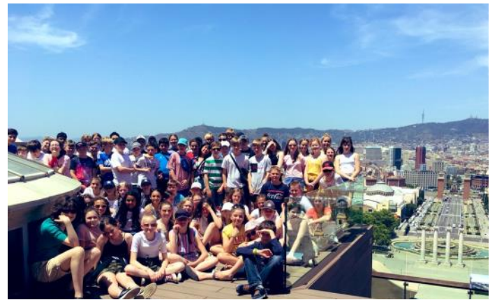
Year 7 Barcelona Trip