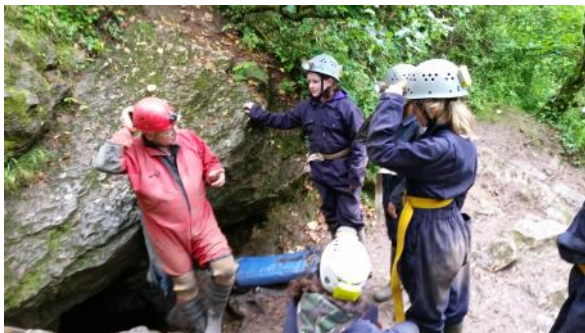
Year 7 Caving Trip