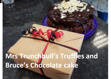
Mrs Trunchbull's Truffles and Bruce's Chocolate cake