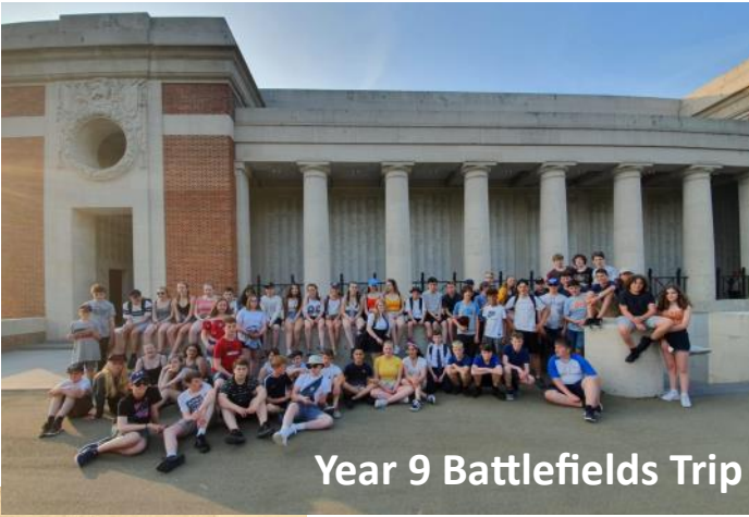
Year 9 Battlefields Trip