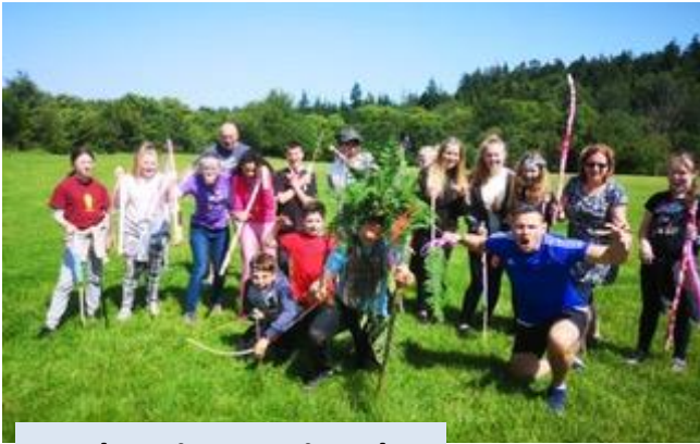
Outdoor immersion day