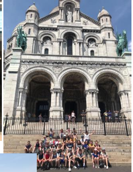
Year 7 Paris Trip