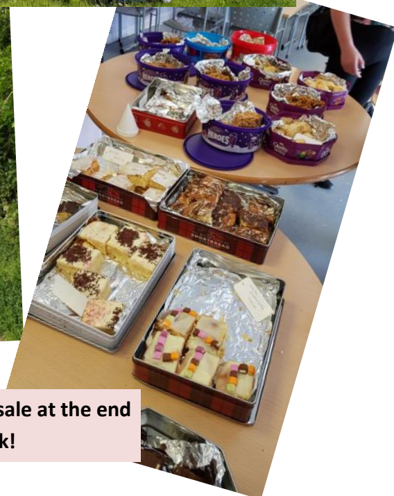
Cakes for sale at the end of the walk!