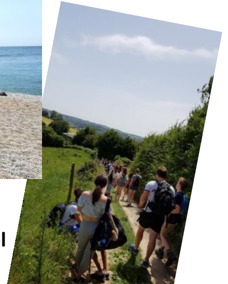
Oldfield Whole School Sponsored Walk