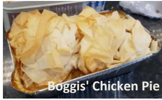
Boggis' Chicken Pie