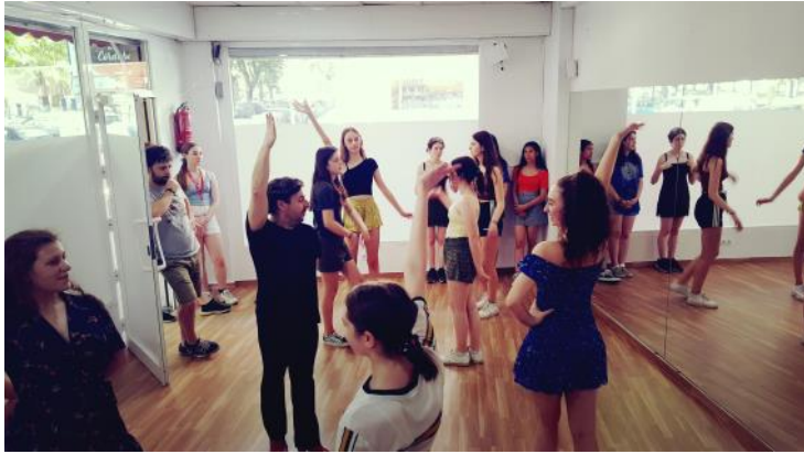
Spanish Immersion Trip to Cordoba