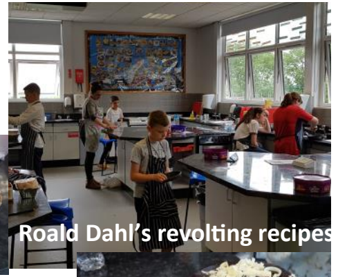
Roald Dahl's revolting recipes