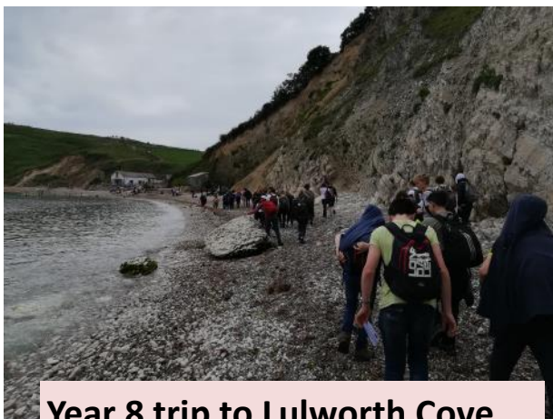
Year 8 trip to Lulworth Cove