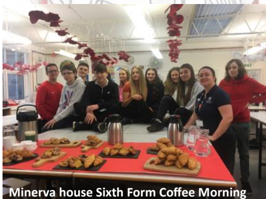
Minerva house Sixth Form Coffee Morning