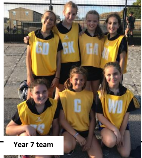
Year 7 team

Year 7 netball practice is on a Wednesday 3pm-4pm and new members are always very welcome.