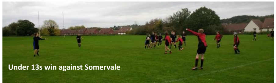
Under 13s win against Somervale

We have been incredibly proud of the progress and development shown by the Under 13s rugby team. We have focused on developing our attacking skills, maintaining possession, continuity in play and defensive techniques. The team have demonstrated professional