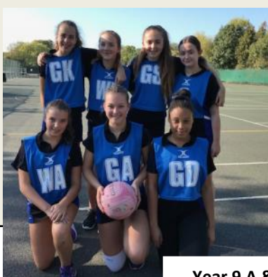
Year 9 A & B team