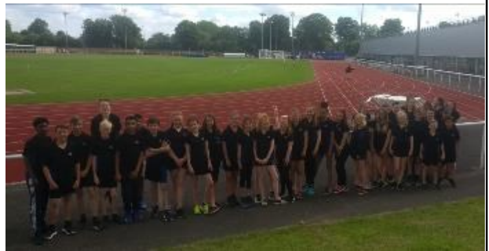
Oldfield PE staff