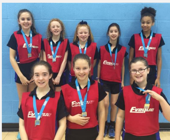
Well done to all the students that took part.