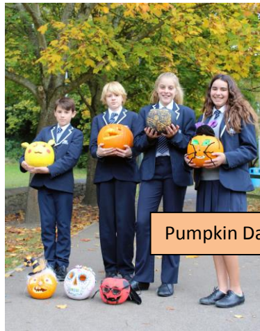
Pumpkin Day at Oldfield!