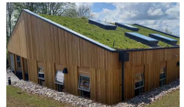
The Hemmings' Centre

We also have Pastoral Support Officers and a School Nursing Officer on site as well as a range of outside services who support students in school such as the School Nursing Service and Off the Record.