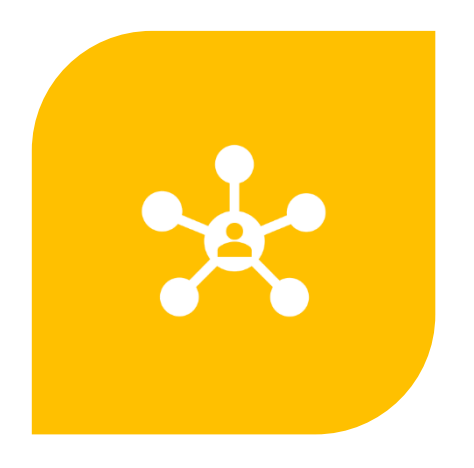
OTHER ASPECTS OF THE COURSE-FOR EXAMPLE, LINKS WITH INDUSTRY AND WORK PLACEMENT