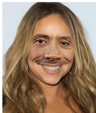
Mariah Carey Dwayne Johnson