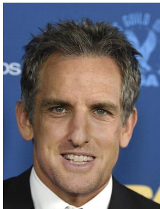
Owen Wilson Ben Stiller