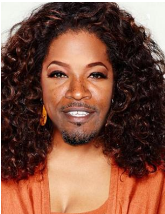
Oprah Winfrey Jamie Foxx